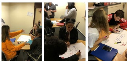
Biglocal - Little Voices