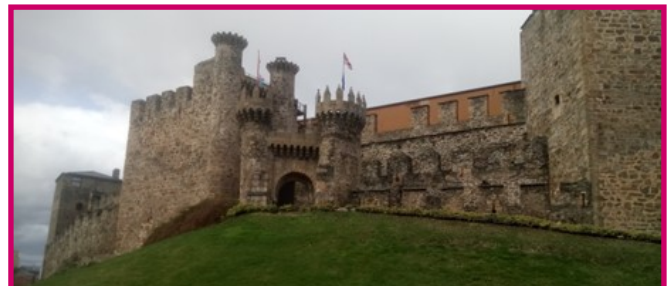
Templar Castle in Ponferrada