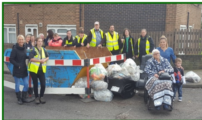
Cleaning up Wallace Close in 2017

Following the success of last years 'Dump Your Junk' project Grace Mary to Lion Farm Big Local have teamed up with Litter Watch and Sandwell Council again to hold clean up events across the area.