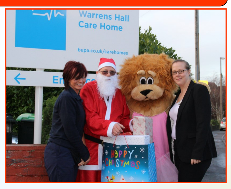
Father Christmas and Big Local's Gracie the Lion

On hearing the sad news GM2LF Big Local Partnership contacted the nursing home to make a donation to cover the value of the stolen gifts.