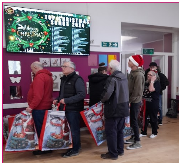
Hamper packing at St James Church

Thank you to Wallace Youth Project, Holy Cross Church, Oakham Church, St James Church, Lion Farm Action Centre and the amazing volunteers who made it all possible.